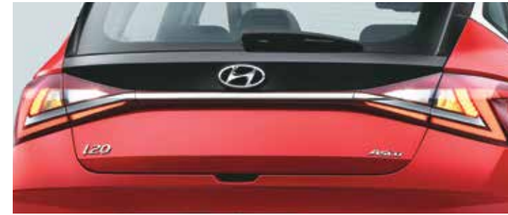
Z-shaped LED tail lamps