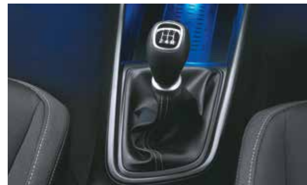
MT & 6MT