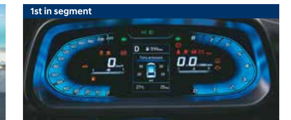
Tyre pressure monitoring system (highline) with display on MID

Other features: Impact sensing auto door unlock | Speed sensing auto door lock | Rear defogger with timer | Central locking (door & tailgate) | Automatic headlamps | Head lamp escort function | Burglar alarm | Driver rear view monitor (DRVM) | Height adjustment seat belt - driver & passenger | Rear camera with dynamic guidelines | ISOFIX | Emergency stop signal (1st in segment) ^Electronic brakeforce distribution