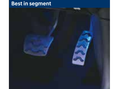
Best in segment