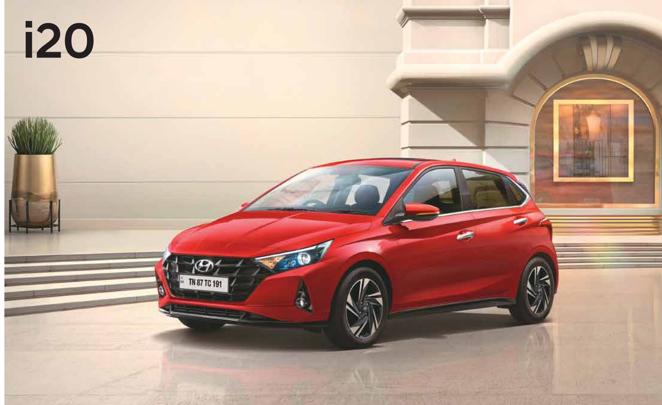
Copyright © 2023, Hyundai Motor India Limited. All Rights Reserved. Jan-Feb, 2023