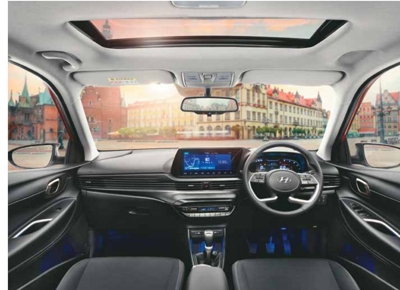
Soothing blue ambient lighting

Step inside and get entranced by its exquisitely appointed, sporty black interiors with colour inserts. Relish the premium ambience every time you take it for a spin. Superior leather* upholstery and ambient lighting elevate your senses to a new high.