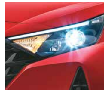
LED projector headlamps