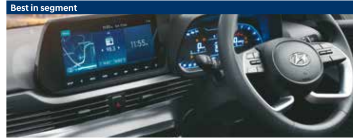
26.03 cm (10.25") HD touchscreen infotainment & navigation system