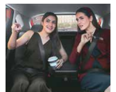
Rear seat armrest