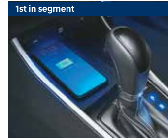
Wireless charger with cooling pad