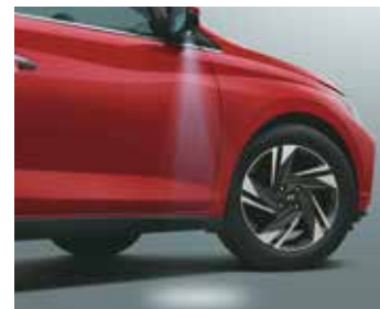
Puddle lamps with welcome function