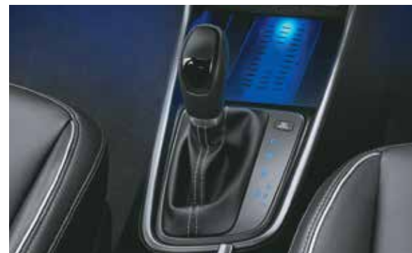
DCT & IVT