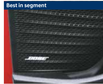
Bose premium 7 speaker system