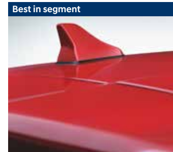
Best in segment