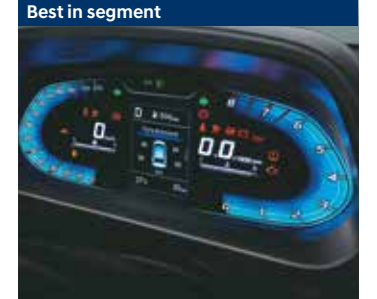
Best in segment