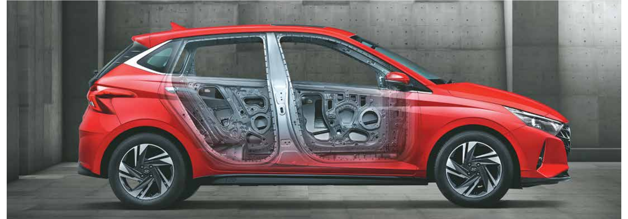
Strong body structure (with 66% AHSS and HSS)