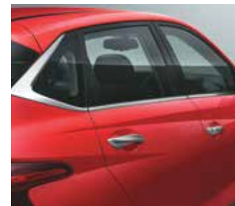
Chrome beltline with flyback rear quarter glass

Other features: Chrome outside door handles | Turn indicators on outside mirrors | Painted black finish side sill garnish with i20 branding | LED daytime running lamp (DRL) | Front projector fog lamps Best in segment