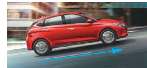
Hill assist control (HAC)