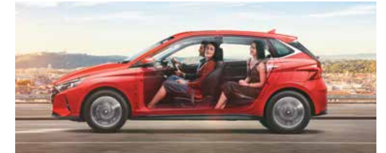
Superior leg room and thigh support