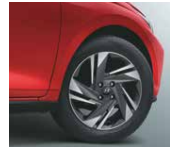
R16 (D=405.6 mm) diamond cut alloy wheels