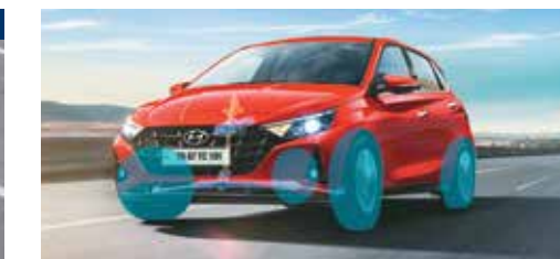
Electronic stability control (ESC) with vehicle stability management (VSM)